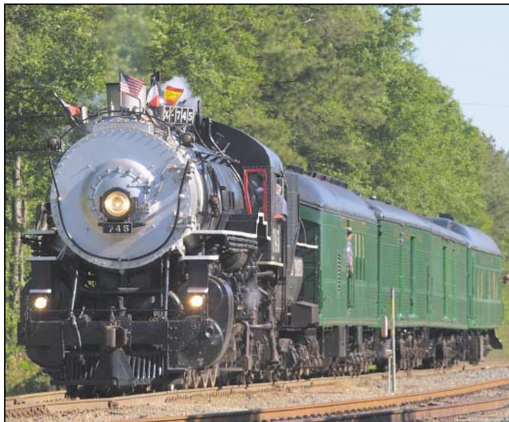
This month's winning photograph was taken by Leo Persick , a member of Local 331 in Temple, Texas. The photo shows the 2005 Louisiana Bicentennial Train, powered by a Southern Pacific steam locomotive SP#745, with exhibit cars that contain historic items.

Remember to review your employer's policies regarding use of cameras on the property or during work hours.