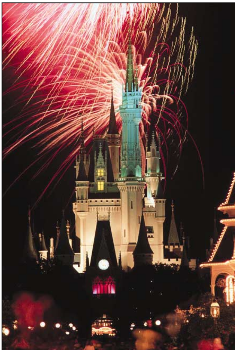
There is magic in the air, day and night, at the Magic Kingdom, EPCOT and all the other attractions in Orlando.