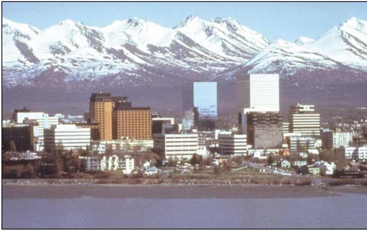
From shopping to theaters to history to outdoor adventure, Anchorage offers a wide range of activities to visitors.

The golf outing will be held Sun., June 12, at the Anchorage Golf Course, 3651 O'Malley Road, Anchorage; phone (907) 522-3425. The course is located at the base of the Chugach Mountains, overlooking the Anchorage-bowl area with breathtaking views of Cook Inlet and Mt. McKinley. There will be a 5:45 a.m. pickup at both hotels with a 7 a.m. shotgun start. Rental clubs are available. The cost is $80 per golfer.