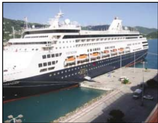
Holland America Veendam

Gone With the Wind Travel is currently offering the perfect trip to take before the UTU Regional Meeting in Anchorage, Alaska, June 13-15, 2005: an Alaskan Cruise . The cruise departs Vancouver, B.C., on June 5 and arrives in Anchorage on June 12, just in time for the Regional Meeting.