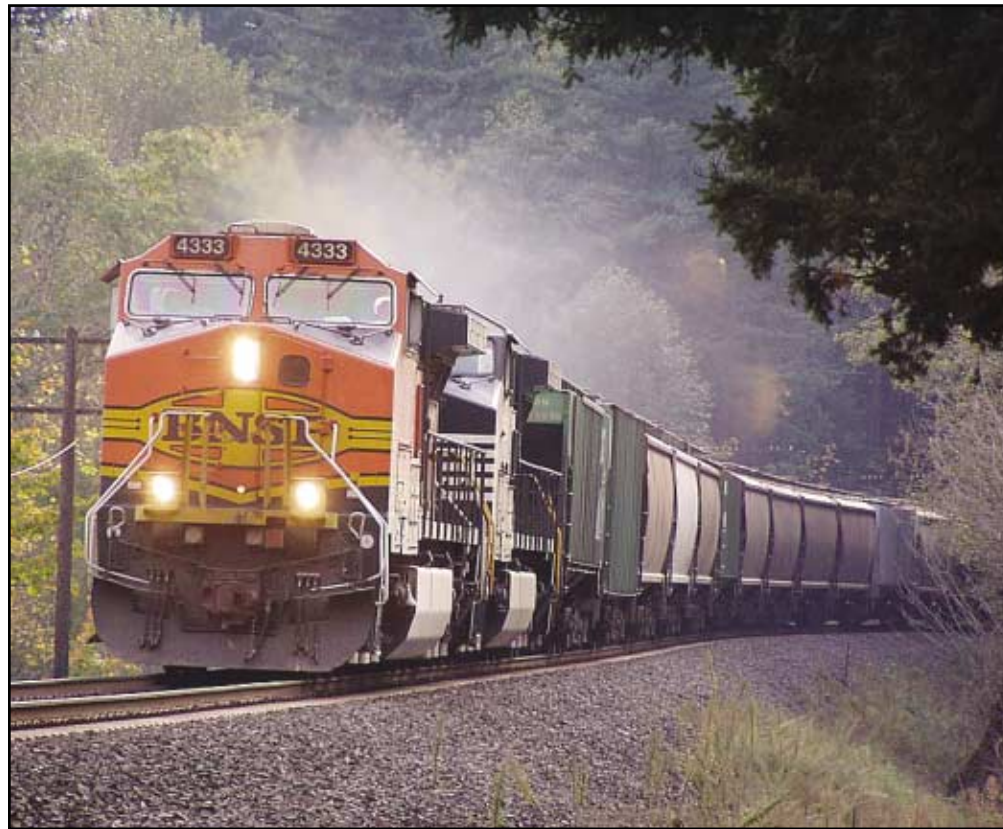
This month's winning photograph was taken by George Landrock , a member of Local 117 in Vancouver, Wash. The photo shows a BNSF grain train in the Columbia River Gorge near Skamania, Wash.

Remember to review your employer's policies regarding use of cameras on the property or during work hours.